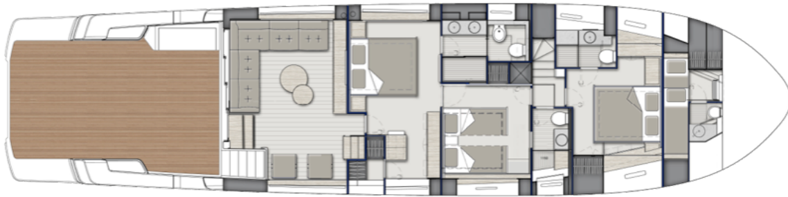
LOWER DECK A with twin beds configuration